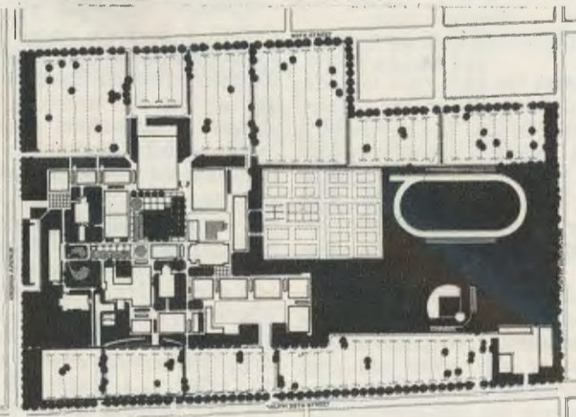
--- Present Parking lot — Proposed parking lot